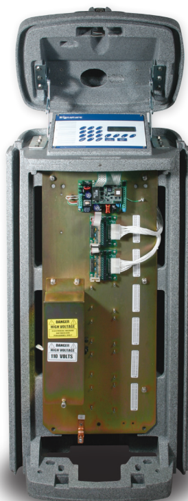
Plastic Pedestal front view with 32 stations (2 C modules x 16 stations per module = 32)